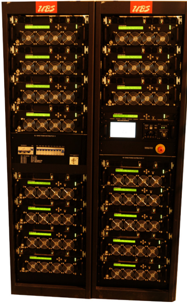
X-Band 6.6kW SSPA System

with 1+1 combining and and 1:1 reservation